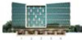
Zone E Food & Beverages