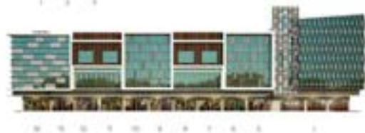
Zone D Offices No. 5 - 16, 1