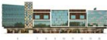
Zone B Banking No. 9-16