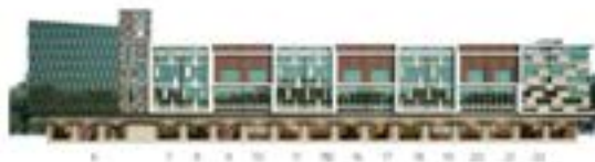
Zone E Food & Beverages