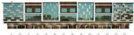
Zone A Services No. 9-16