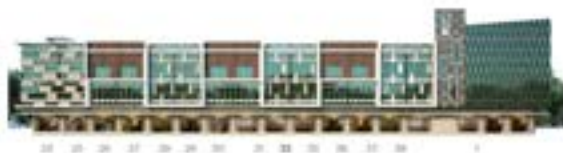
Zone E Food & Beverages