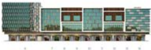
Zone C Retail No. 8 - 16