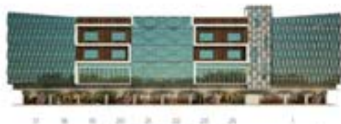
Zone B Banking No. 17-25, 1

Ruler A.S. telah menggunakan inovasi Schneider untuk 500 perhias.