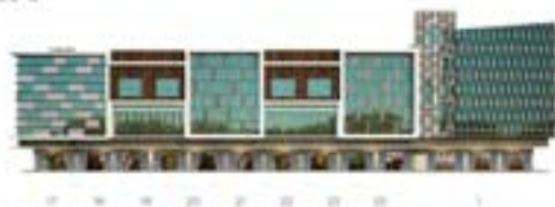
Zone C Retail No. 17 - 25, 1